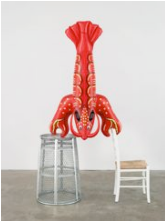
Jeff Koons Acrobat 2003–09 Polychromed aluminium, galvanised steel, wood and straw 228.9 x 148 x 64.8 cm Bill Bell Collection

Koons uses motifs and references to art movements and history throughout his work. Lobster and the Moustache both reference Surrealist artist Salvador Dali, famous for his curled moustache and his sculpture Lobster Telephone (1936). The moustache can also be linked to Marcel Duchamp's painting L.H.O.O.Q. (1919). This artwork is a reproduction of Leonardo da Vinci's Mona Lisa onto which Duchamp drew a moustache and a beard in pencil and appended the title. Besides Duchamp and Dali, Koons appropriates images from Andy Warhol and H.C. Westerman, an American post war printmaker and sculptor.