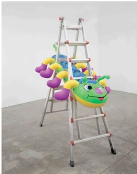
Jeff Koons Caterpillar Ladder 2003 Polychromed aluminium, aluminium, plastic 213.4 x 111.8 x 193 cm Collection of Rachel and Jean-Pierre Lehmann © 2009 Jeff Koons

The relationships between the replica ready-mades with unaltered everyday objects vary throughout the exhibition. In some works the interaction between the two counterparts is playful and dance-like. In others the inflatable creatures are stuck, squeezed or constrained.