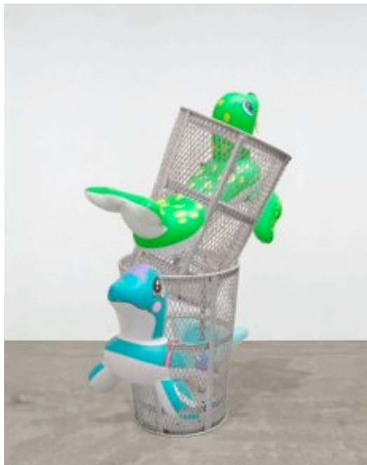
Jeff Koons Seal Walrus Trashcans 2003-2009 Polychromed aluminum, galvanized steel 170.2 x 76.2 x 91.4 cm