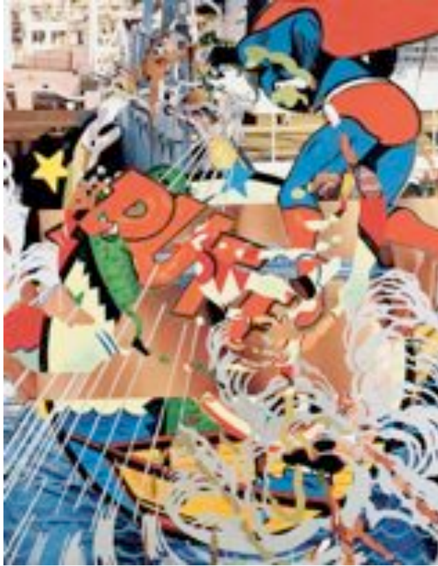
Jeff Koons Olive Oyl 2003 Oil on canvas 274.3 x 213.4 cm Courtesy of The Dakis Joannou Collection © 2009 Jeff Koons