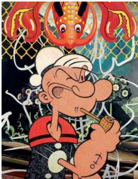
Jeff Koons Popeye 2003 Oil on canvas 274.3 x 213.4 cm