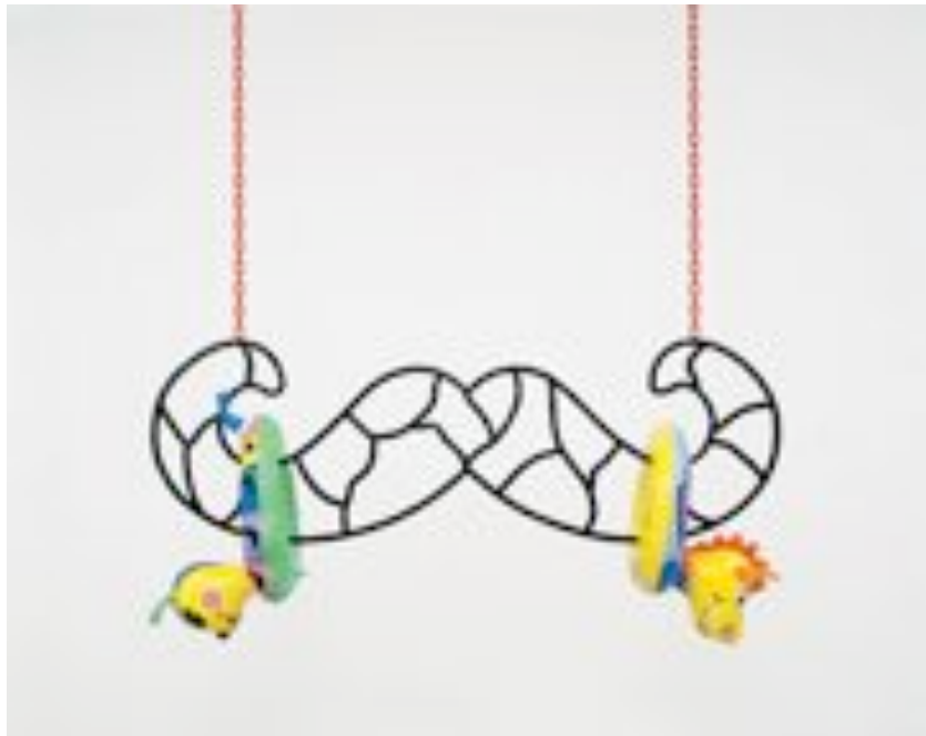
Jeff Koons Moustache 2003 Polychromed aluminium, wood and coated steel chain 260.4 x 53.3 x 191.8 cm Galerie Jérôme de Noirmont, Paris © 2009 Jeff Koons