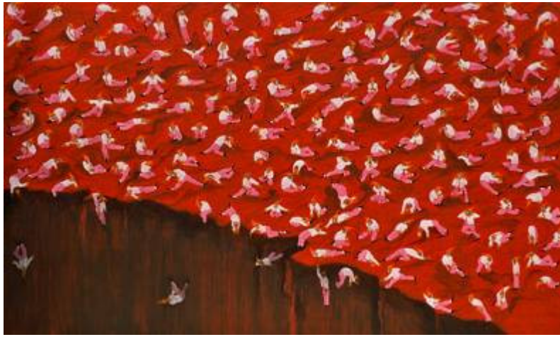
N. S. Harsha, Melting Wit 2006 Acrylic on canvas 168 x 290 cm © 2008 N. S. Harsha Photograph Pavan K J