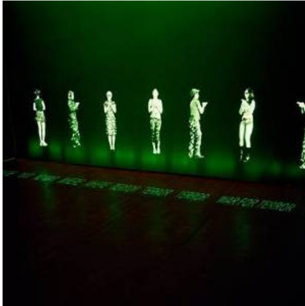
Shilpa Gupta, Untitled 2004-05 Interactive video projection and sound 6-8 metres © 2008 Shilpa Gupta

Blessedbandwidth.net , 2003, commissioned by Tate Online, explored religion, with users offered the opportunity to be blessed over the internet.