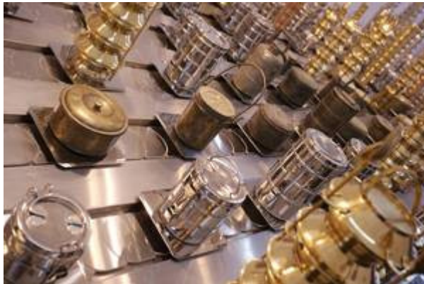
Subodh Gupta Untitled (detail) 2007-08 Motor, wire, old utensils, aluminium and stainless steel, 700 × 210 × 76 cm Courtesy Jack Shainman Gallery, New York © 2008 Subodh Gupta

Subodh Gupta elevates the status of found objects from everyday items to artworks, using the products of rural India such as cow dung, milk buckets, kitchen utensils, scooters, guns and gulal powder as materials in order to examine Indian society. He works across a full range of media as an artist: sculpture, painting, installation, photography, video and performance.