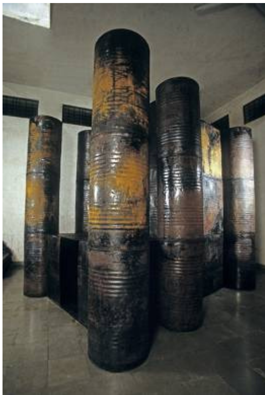
Sheela Gowda Darkroom 2006 Tar drums, tar drum sheets, asphalt and mirrors 238.8 x 259.1 x 304.8 cm Courtesy Shumita and Arani Bose Collection, New York © 2008 Sheela Gowda

Sakshi Gupta (born 1979) is a sculptor and is concerned with the textural qualities of her medium. Gupta employs a variety of materials including discarded locks, gears, nuts and bolts, metal chips and nails. By manipulating and teasing the inherent materiality of her chosen medium her works successfully tie together the propositions of fragility, inflexibility and ephemeral lightness.