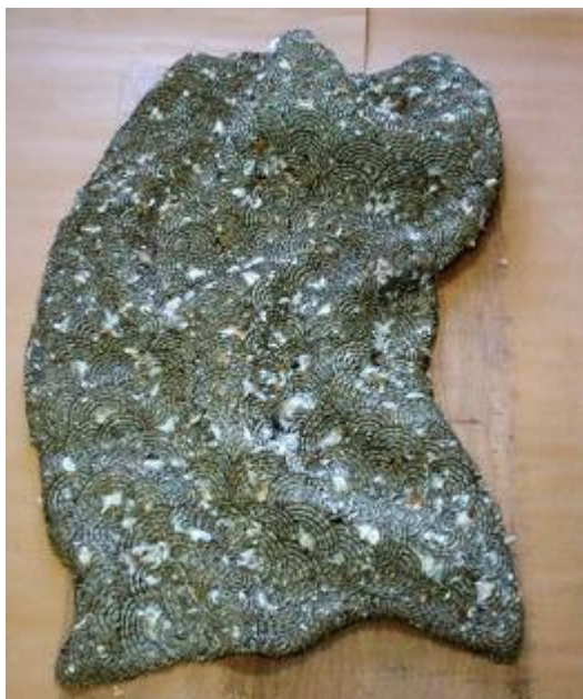
Sakshi Gupta Landscape of Waking Memories 2007 Galvanised wire, mesh and chicken feathers 165.1 x 93.9 x 25.4 cm