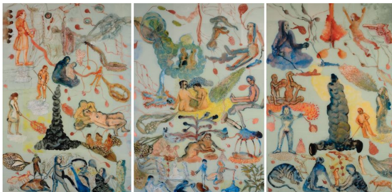
Nalini Malani, Appeasing Radha 2006 Acrylic and enamel reverse painting on acrylic sheet 185 x 366 cm Courtesy Galerie Lelong, Paris © 2008 Nalini Malani

Nalini Malani's practice encompasses painting, drawing, installation, shadow play and video art. The artist layers up a range of sources from different histories and cultures, including her personal experiences, stories of those marginalized in society and episodes from literature or myth, from Lewis Carroll's Alice in Wonderland to the Hindu epic Bhagavata Purana .