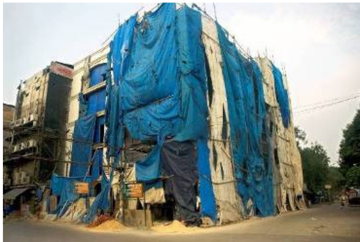
Ravi Agarwal Debris I 2007 Archival inkjet print 50.8 × 76.2 cm © 2008 Ravi Agarwal

The photography of Ravi Agarwal combines social documentary, environmental activism and – more recently – self-exploration. The series Immersion.Emergence – 24 Images , 2007, examines New Dehli's Yamuna River in terms of 'personal ecology', recording the artist wrapped in a shroud by the riverbank. 'It is my relationship to the dirty, polluted, but holy river which is also the lifeline of the city of 15 million people.'