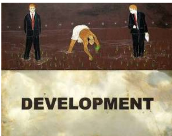
N. S. Harsha, Development 2003 Acrylic on canvas and etched bronze on wood Two panels: 24.1 x 60.3 cm © 2008 N. S. Harsha

N.S. Harsha creates political commentary within the framework of Indian miniature painting. His intricately detailed canvases often depict a multitude of figures all animated in unison, sometimes by something incongruous or comically strange, and combine details of everyday Indian life with images from world news events. Harsha's practice also includes large-scale painting works and community projects.