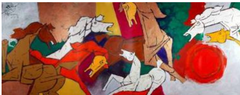
M.F. Husain A panel of wild horses, chasing each other 1996 Acrylic on canvas 144.7 x 365.7 cm Courtesy Yogesh Mehta © 2008 M.F. Husain

Painter M.F. Husain is India's most respected living artist. Born in 1915, Husain was a founding member of the avant-garde Progressive Artist Group in Mumbai in 1947 and helped form a new modernist vocabulary of Indian art following the country's independence. He continues to produce colourful and provocative canvases, incorporating themes from Indian religion and history.