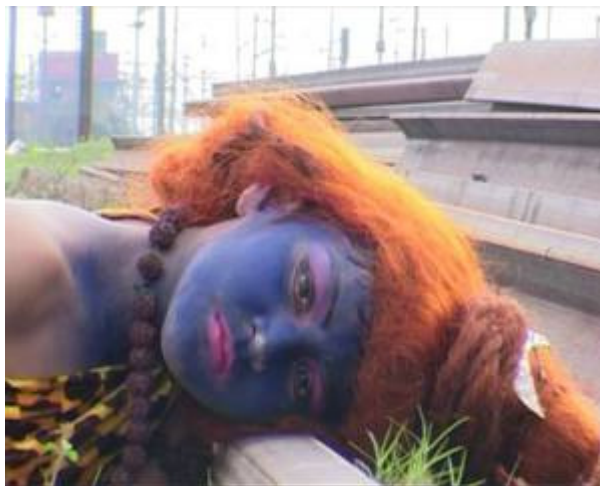
Still from Hawa Mahal © 2008 Vipin Vijay