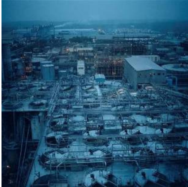
Dayanita Singh, Untitled from the Blue Book 2008

Dayanita Singh (born 1961) is best known for her photographic portraits of India's urban middle and upper-class families. These images of people working, celebrating or resting show Indian life without embellishment. Her latest work such as Blue Scenery Series , 2006-08, has concentrated on depictions of places. The dissemination of her photography as mass-produced or disposable objects such as wallpaper, books, calendars and postcards is a driving force of her recent practice.