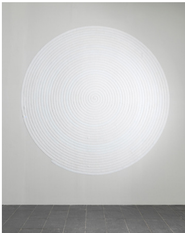
Bharti Kher Virus 2008 Bindi wall-work 300 cm diameter © 2008 Bharti Kher

Working across sculpture, photograph and painting, Bharti Kher (born 1969) explores issues of personal identity, social roles and Indian traditions but also, from a broader perspective, 21st-century issues around genetics, evolution, technology and ecology. Kher uses the bindi as a central motif in her work to connect disparate ideas. The bindi transcends its mass-produced diminutiveness and becomes a powerful stylistic and symbolic device, creating visual richness and allowing a multiplicity of meanings.