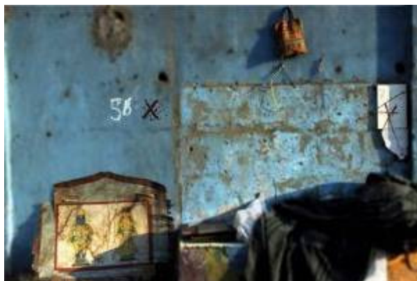
Jitish Kallat Cenotaph (A Deed of Transfer) 2007 20 Lenticular prints Each 44.5 x 66 cm Courtesy Haunch of Venison, Zurich © 2008 Jitish Kallat

Jitish Kallat (born 1974) works in a variety of media including painting, sculpture, photography and installation. His work reflects a deep involvement with Mumbai, the city of his birth and derives his visual language from the immediate urban environment. His subject matter has been described previously as 'the dirty, old, recycled and patched-together fabric of urban India'. Wider concerns include India's attempts to negotiate its entry into a globalised economy, addressing housing and transportation crises, city planning, caste and communal tensions, and government accountability.