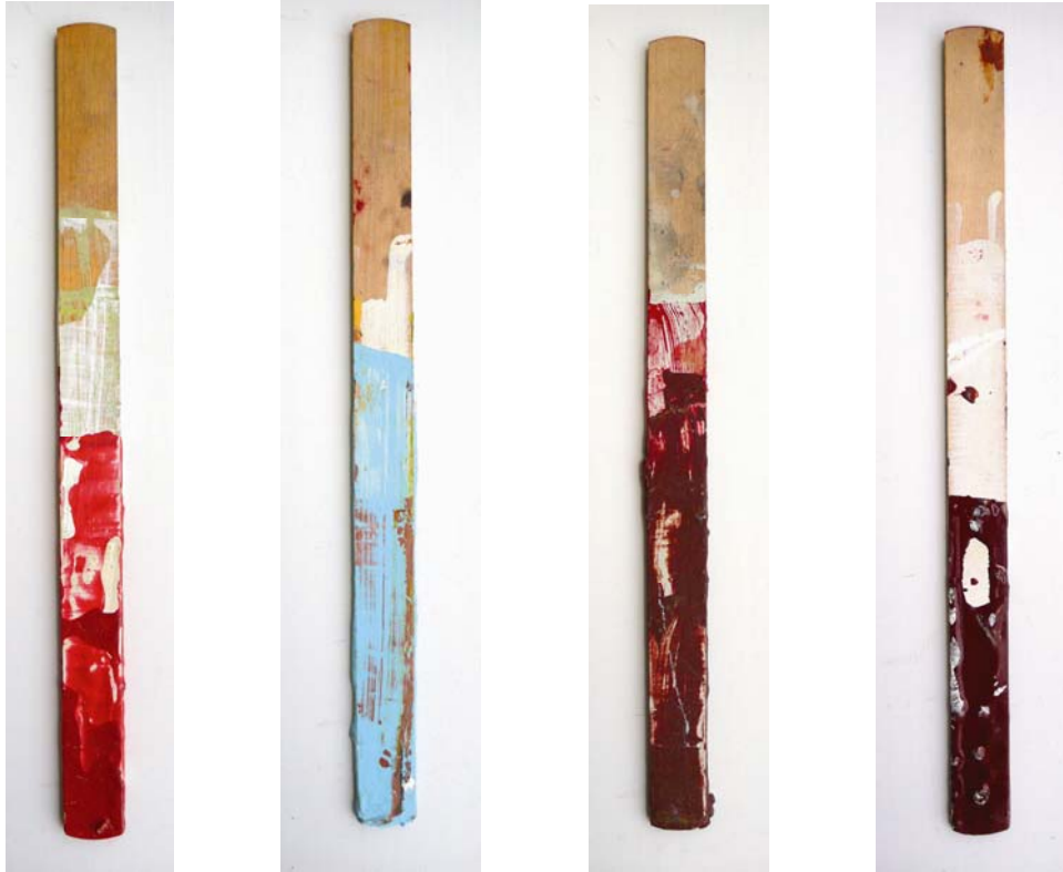
Suspended 2000 (details)