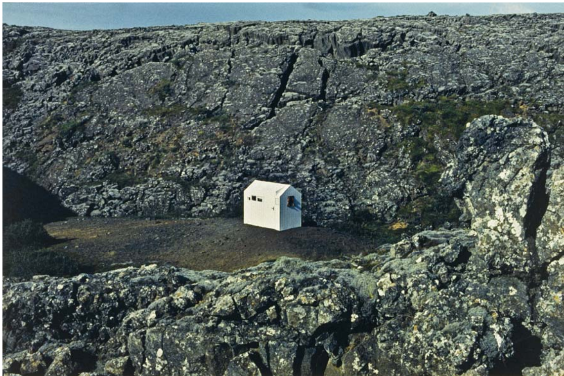
House Project 1974 (detail) 16 colour photographs and typewritten text Each 33 x 40 cm

Art & Design – representing and creating real or imagined places and spaces Citizenship – the individual’s responsibility for their environment – how we look after and improve our communities English – How do we use language to create and describe places? Geography – places, spaces and people. How does the environment impact on the way people live, and how does the way we live impact on the environment? History – How have rural and urban landscapes changed? How are memories captured in time?