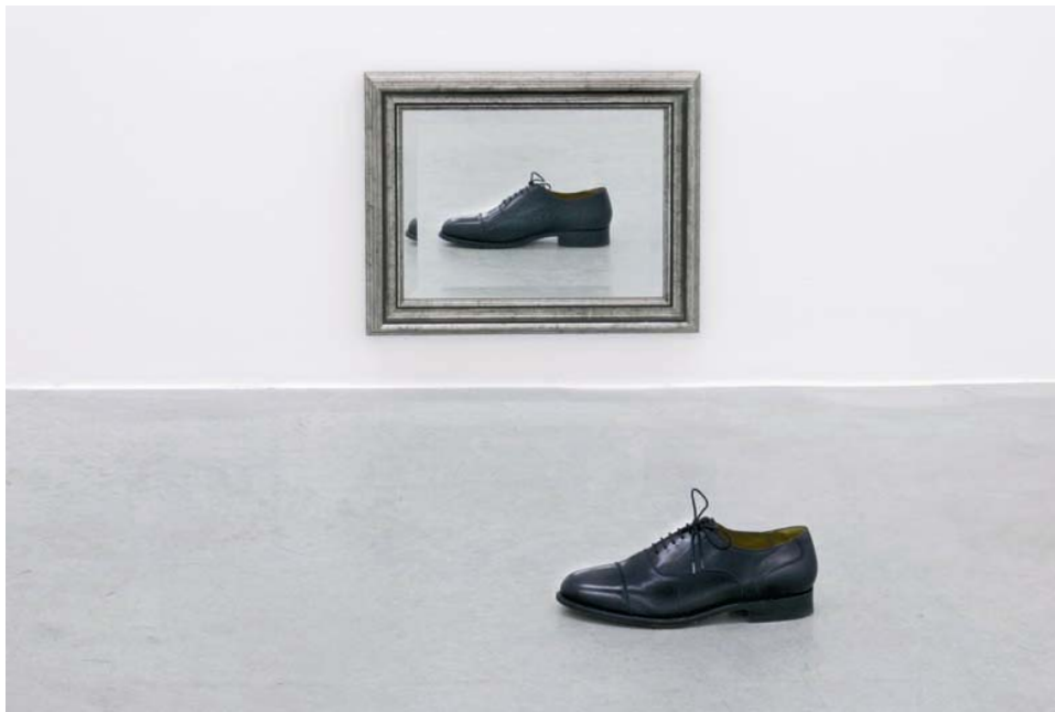
A Pair 2004 Mirror with silver wooden frame and shoe