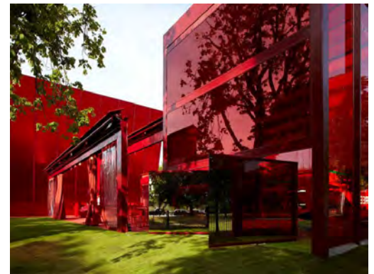
Jean Nouvel Serpentine Gallery Pavilion 2010